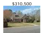
Charleston, SC More Details...