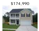
Ridgeville, SC More Details...